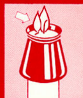
CARE WHILE BURNING